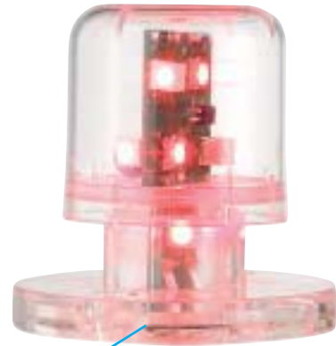
LED-bulb shown in socket