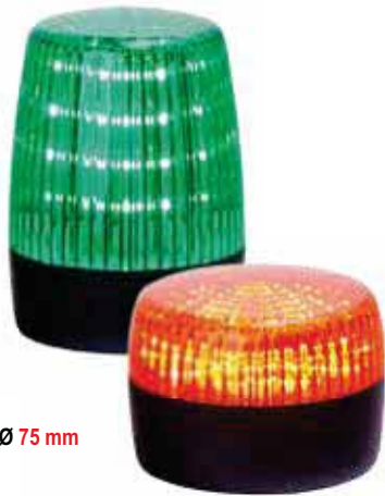
Ø 75 mm

LED Steady/Flashing/Multi Strobe Beacons LED Multi Colour Beacons Xenon Strobe Beacons